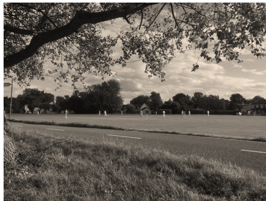
Thaxted Cricket Club one among Thaxted's many clubs and activities.

It is possible to contribute more if you wish. Your gift's use and an acknowledgement can be agreed.