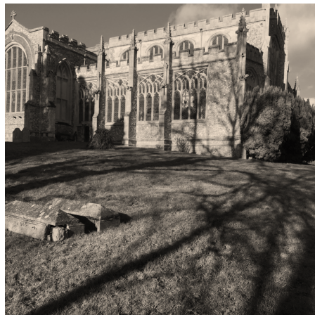
Atop the hill it sits year on year and century after century