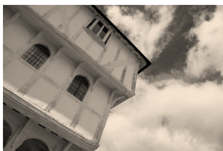
Your Society considers all angles.