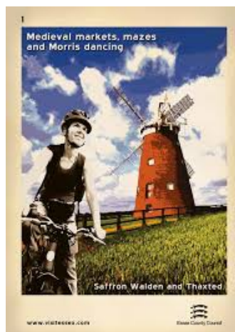
Thaxted has long been a destination of choice for the discerning cyclist.