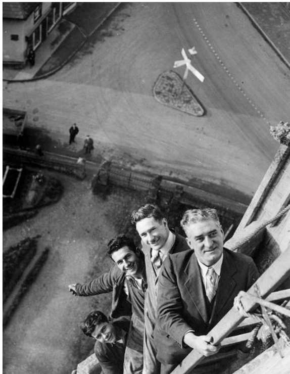
Three generations of steeplejacks on Thaxted's spire. But who are they?

Single £10.00 per year - Couple £15.00 per year