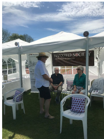
the Thaxted Society stand at the Fayre of 2019 we will return to the Fayre in 2022. see back cover

It is possible to contribute more if you wish. Your gift's use and an acknowledgement can be agreed.