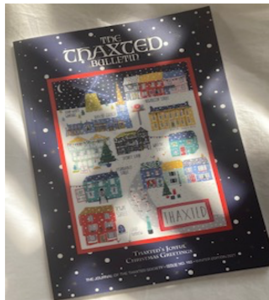
Christmas edition 2021