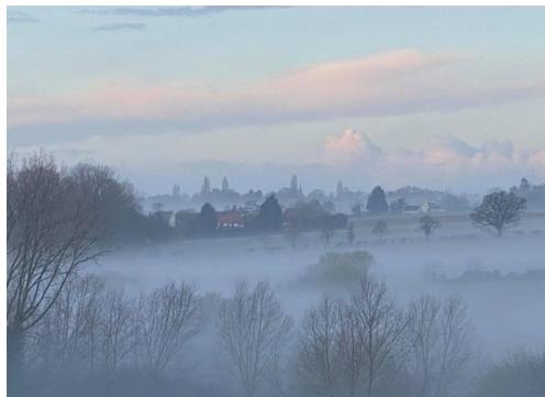
Thaxted's mists and mellowness